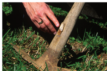
Ann Czapiewski, USDA

Gypsy moth egg masses can be found on outdoor equipment and tools that sit outside. Inspect equipment and tools for gypsy moth egg masses before a move.